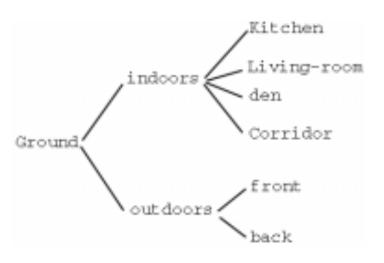
Figure 2: Graph representation of a semantic network example.

where the symbol \subset is represented by <. The figure 2 represents the graph conforming the network specified.