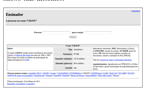
Figure 4: Start point when using Ensinador.

tem: it requires the user to introduce a search string, using the Corpus Query Processor (CQP) syntax (Christ et al., 1999; Evert and the OCWB Development Team, 2010), and to select the corpus to be searched. Optionally, the user might choose to define a title for the exercise section being created. Figure 4 shows this interface.