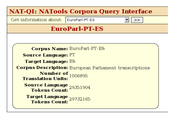
Figure 2: NatAbout: query corpora metainformation.